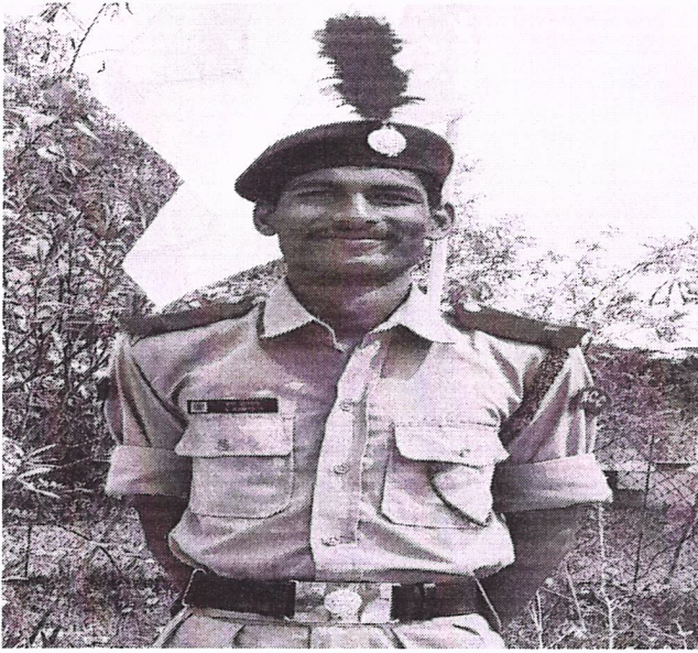
Inter Battalion Shooting Competition Championship 2022-23